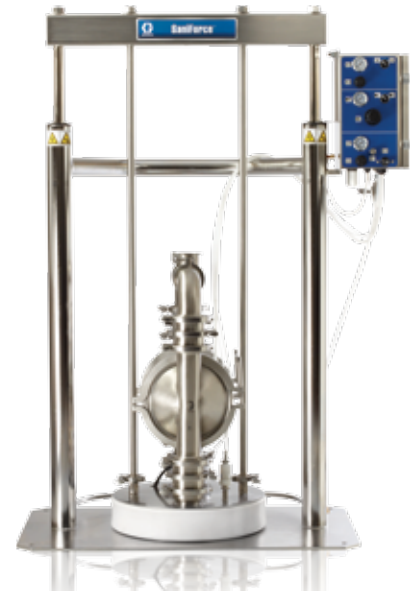
SaniForce 3150 Drum Unloader

All written and visual data contained in this document are based on the latest product information available at the time of publication. Graco reserves the right to make changes at any time without notice.