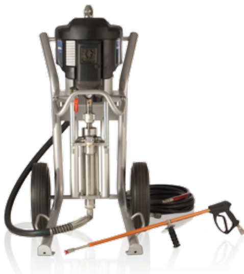
Hydra-Clean® Pressure Washers

Our industrial equipment offers a complete line of priming piston and air-operated double diaphragm pumps for low to high viscosity fluids for a wide range of applications.